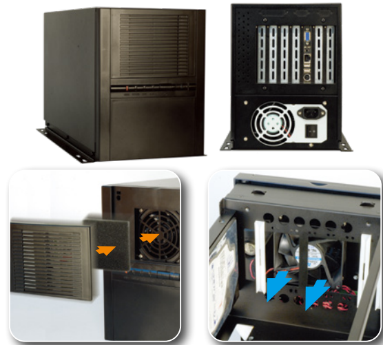
Replaceable fan filter

CD-ROM and HDD are not included in package.